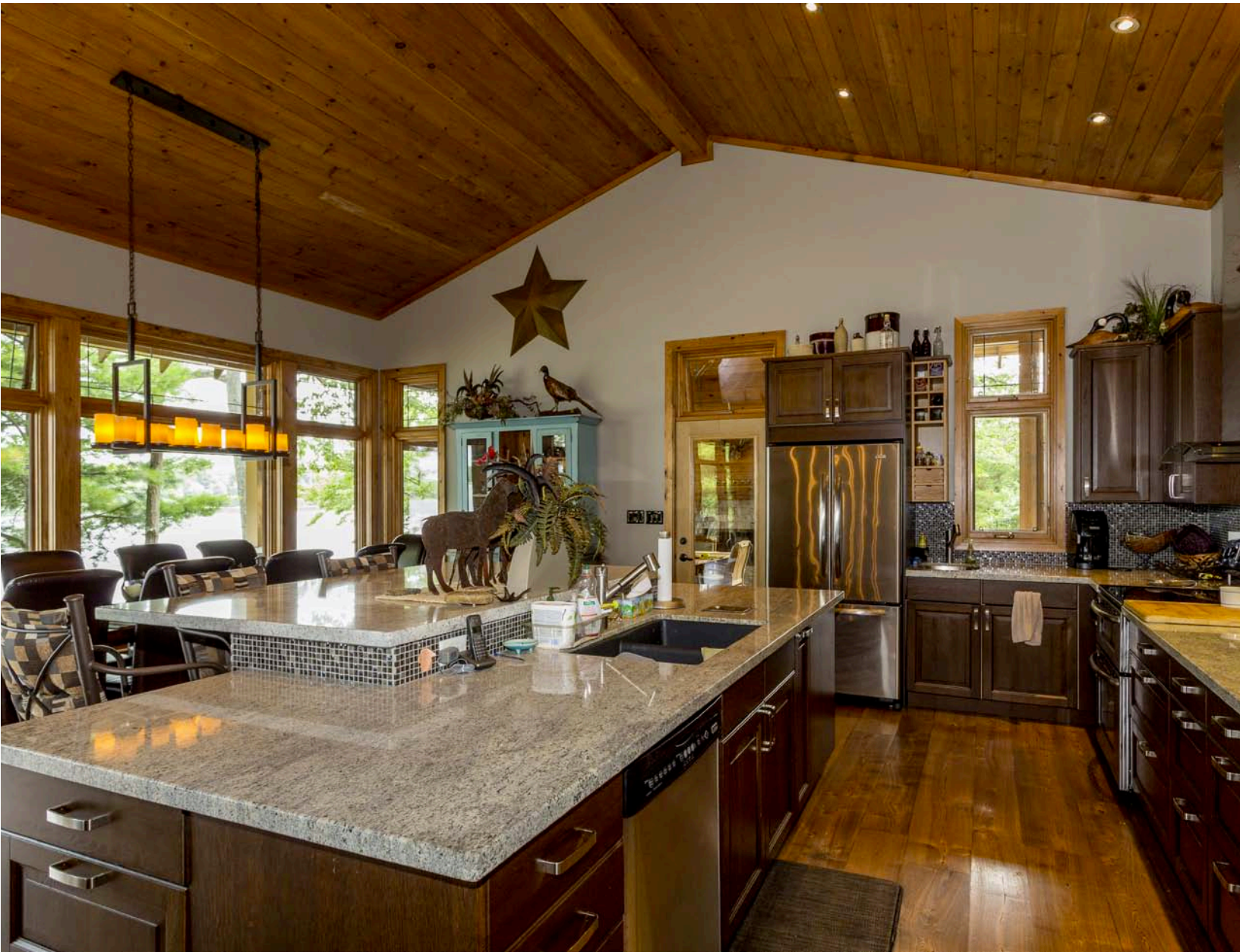
The spacious kitchen offers generous storage and prep. areas. Cabinetry is oak, countertops granite and appliances stainless steel. A central two level island seats 4.