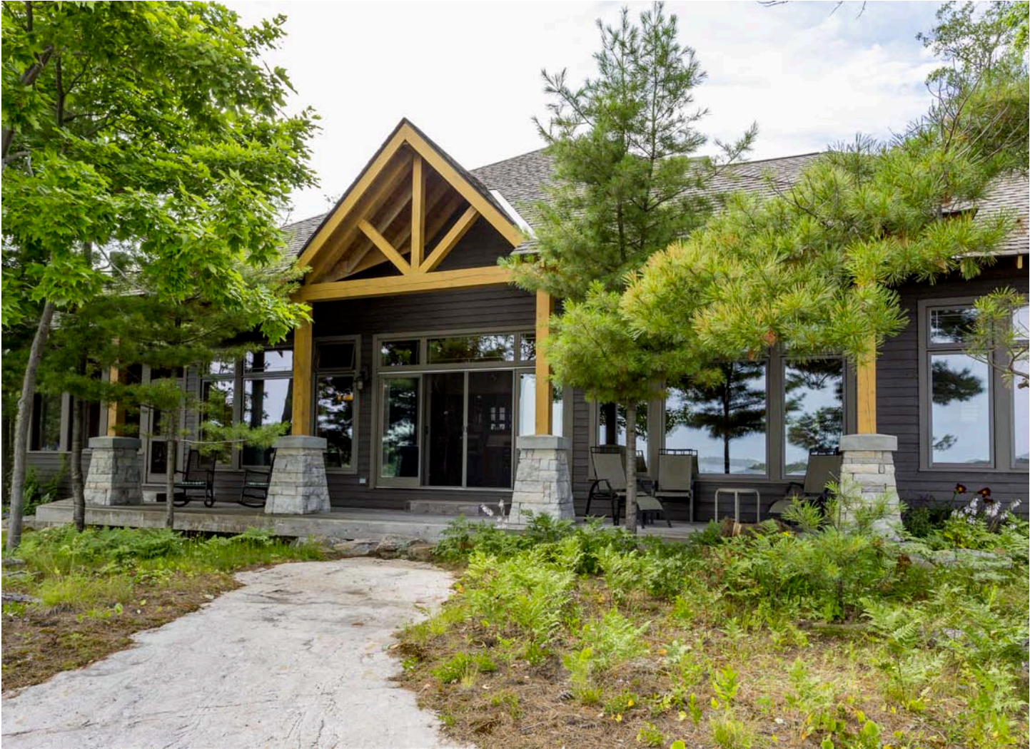
The 'Arts and Crafts' style exterior features dry stack limestone based cedar columns, 'rafter tail' porch overhangs, aluminum clad wooden windows, cedar decking and 'Gemthane' wood siding, all ensuring low maintenance.