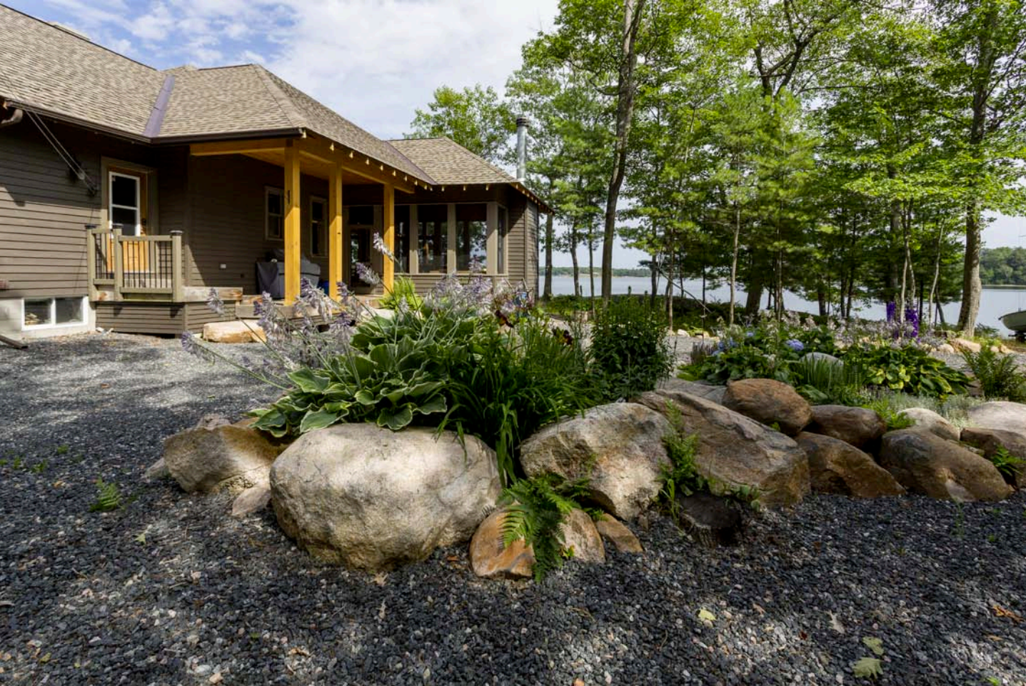
Perennial gardens and natural rock border the cottage and turn circle drive. Landscape lighting enhances the outdoor scene after nightfall.

Beside the screened porch a covered deck and barbeque area is conveniently close to dining and kitchen.