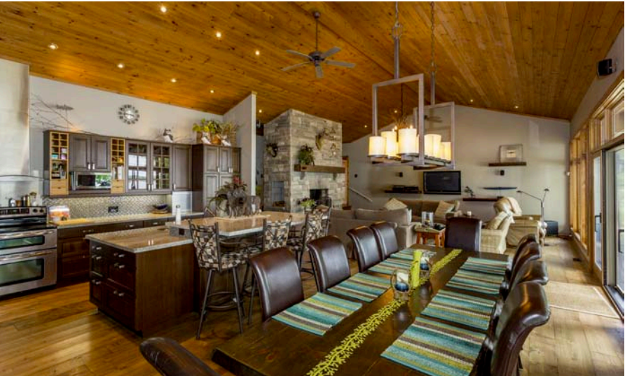
A handcrafted 'live edge' pine trestle dining table comfortably seats ten.