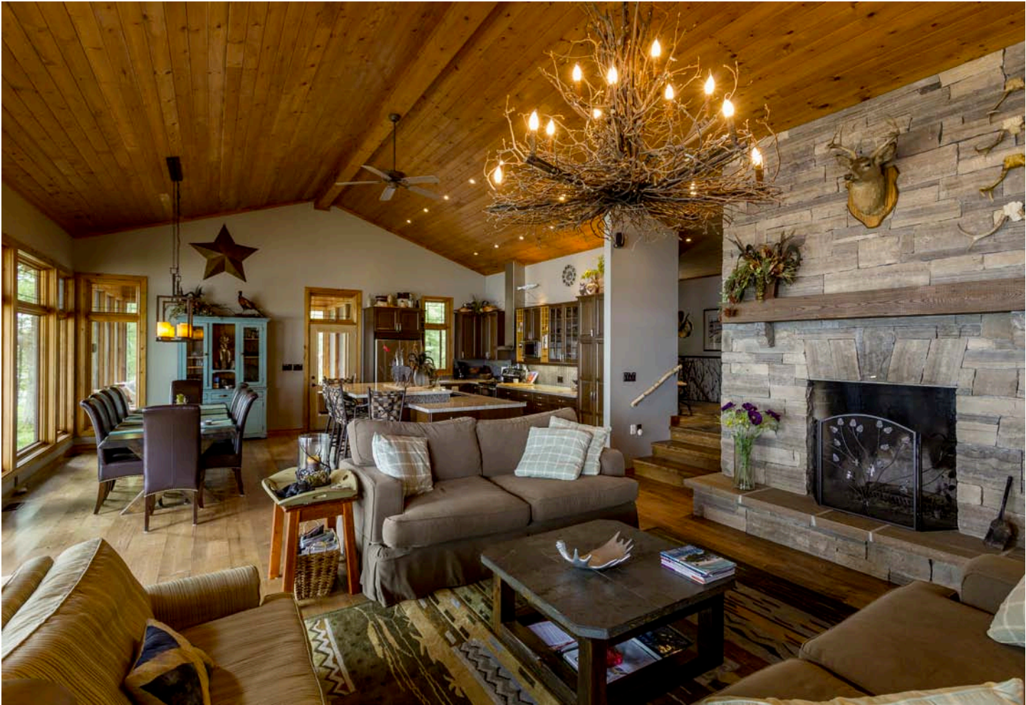
A drystack ledge rock fireplace anchors the living room area. A Rumford style fireplace, it was built by Parry Sound craftsmen, Felsman Brothers.

The 800 square foot great room comfortably accommodates large numbers in kitchen, dining and living areas. It features a paneled vaulted ceiling, antique ash floors and a forty foot long south facing window wall which floods the room with light and offers glorious views of the water.