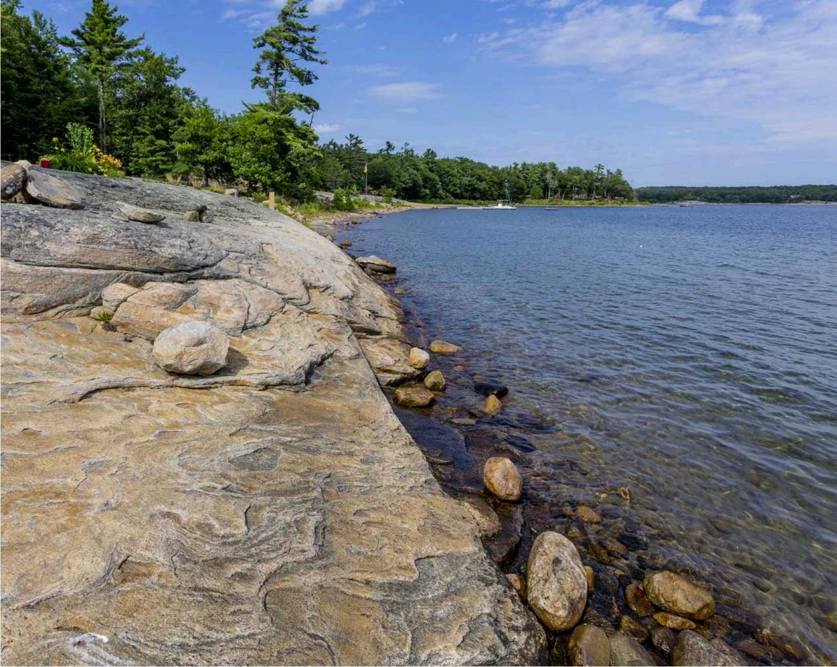
Iconic Georgian Bay... Smooth Granite, White Pines, Clear water.