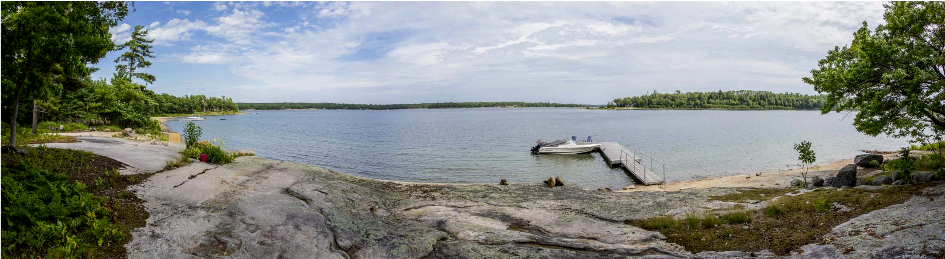
Views from the cottage: smooth granite shoreline, sand beach, a deep water harbour and the Bay beyond.