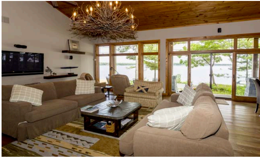
A magnificent five foot 'branchelier' acts as focal point.